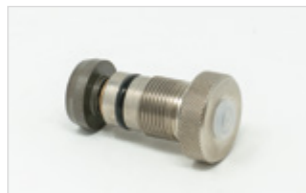
Side roller with side locking screw including locking plug