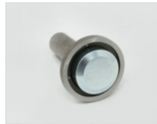
Ball-bearing back roller K/2 top maintenance free