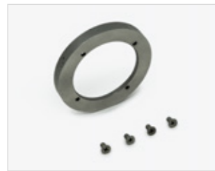
Spare running tread K/1 with screws