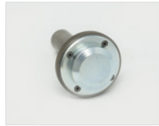
Ball-bearing back roller K/3 top maintenance free