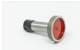
Upper or lower back roll