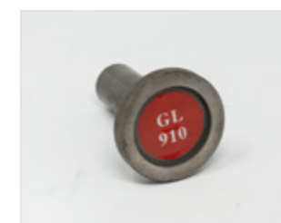
Back roller (in the picture: GL 910)

Side roller GL 910 (usable above) With bearing support Art.: 1311