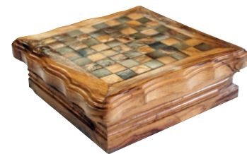
Finished with French Polish.