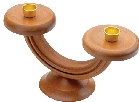
Finished with Finishing Oil.