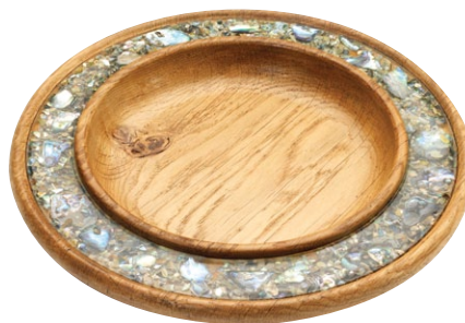
Finished with Citrus Oil.