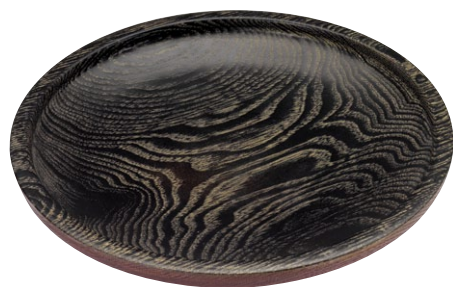
Finished with Spectrum Range Spirit Stains, White Liming Wax and Carnauba Wax.