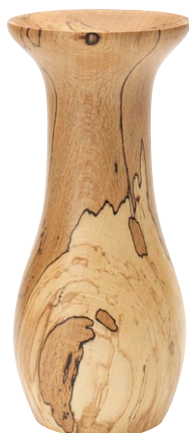
Finished with Shellac Lacacote Sander, Speed an Eez Friction Polish (White) and Carnauba Wax.