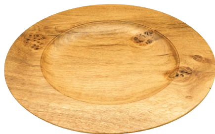
Finished with Clear Paste Wax.