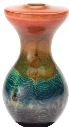
Finished with Spectrum Range Spirit Stains, Cellulose Sanding Sealer Aerosol and Melamine Lacquer Aerosol.