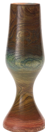
Finished with Spectrum Range Spirit Stains, Metallic Spirit Stains, Acrylic Sanding Sealer and Acrylic Gloss.