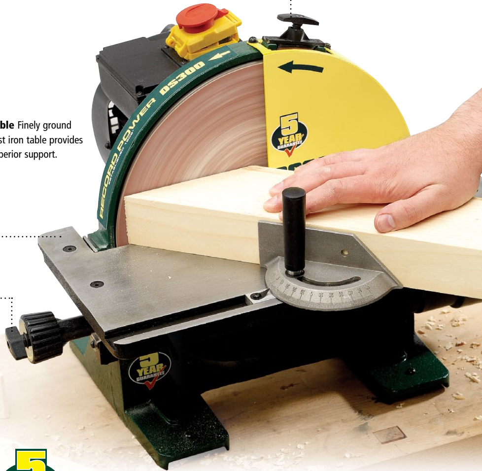
Table Finely ground cast iron table provides superior support.

Value for Money ★★★★★ Performance ★★★★★ Build Quality ★★★★★ Woodworking Plans & Projects ★★★★★