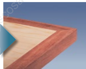
The CE53S is very effective for flushing straight or rounded corners.