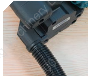
Dust collector connection.