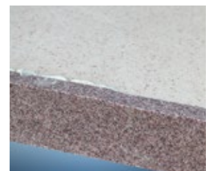
Perfect finishing on solid surface material.

Flushing works on wooden or solid surface materials are very accurate, allowing to have a perfect integration of surface together with the strips or edges.