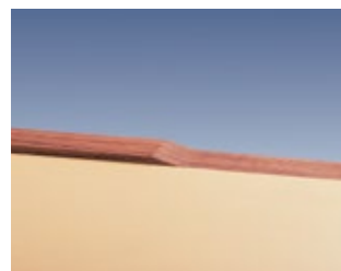
Accurate cut, easy adjustable.

Flushing works on wooden or solid surface materials are very accurate, allowing to have a perfect integration of surface together with the strips or edges.