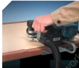
Precise easily adjusted cut.

Special purpose planer for flushing works in the manufacture of furnitures. It is ideal for flushing strips on edges. Provided with a large support surface to allow easy and safe operation. The tool cuts accurately and is easily adjustable. The support base is height-adjustable with respect to the cutting plane of the cutter-holder. Thanks to its high power rating (1,300 W) it can be operated without risk of mechanical fatigue. It is provided with replaceable reversible carbide blades which do not require adjustment and dust collector connection.